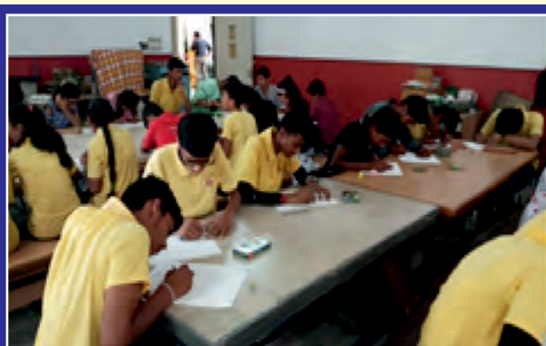
Drawing Competition at Community Science Centre