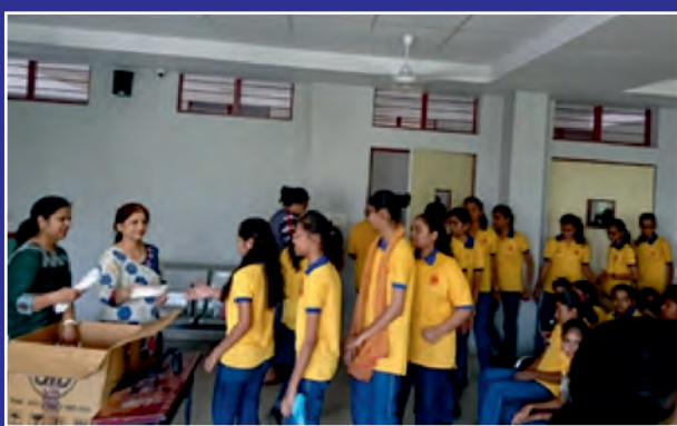
Sanitary pads - Education & Distribution

Knowledge of menstrual cycle & use of sanitary pads could play a critical role in the health & hygiene of young girls & women from the target group. Started this year, the initiative first involves imparting detailed knowledge (Including question-answers) to the target group, followed by regular monthly distribution of pads, hygienically prepared by women's groups. The initiative currently focusses on girls & women around Asha Deep Centres as also on Kayakalp girl students. Over 500 girls & women are being provided pads on a monthly basis.