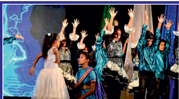
Performance by Asha Deep Children