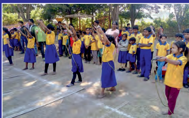
Annual Sports Day at Billabong

What a day to remember – the smiles and the laughter emanating from Deep Down!!