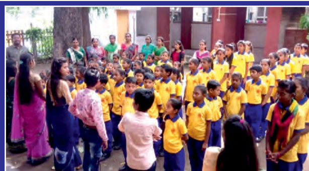
Assembly at New Premises