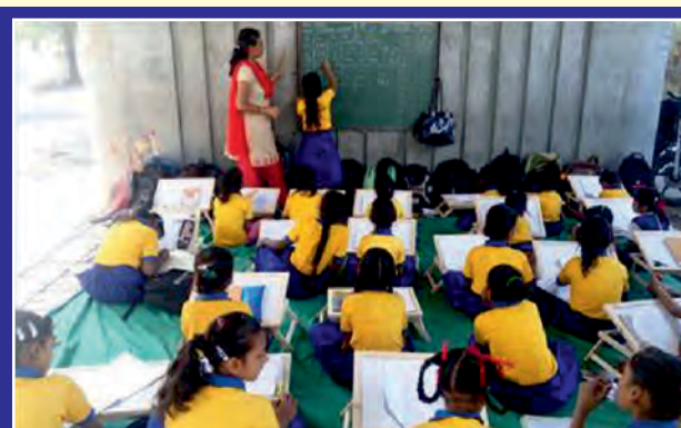
Ashadeep Centre under Lalbaug Flyover

A Street-to-School initiative , with focus on education and development of children of families living on footpaths or slums etc – children who would otherwise be totally deprived of any meaningful education – children whose parents can just make two ends meet through hard work and have no time / inclination to provide for their education. With fifteen centres on footpaths and slums (right where the children are), over 450 students and with amazing commitment from members, volunteers and teachers – the initiative has now become a darling of the citizens.