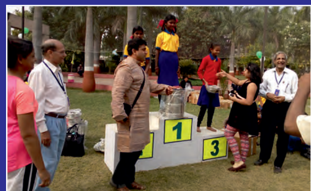
Annual Sports Day at Billabong