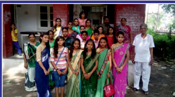
Teachers' Day Celebration