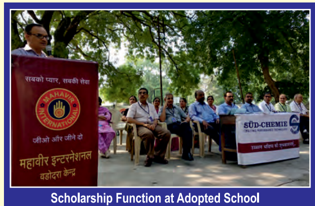
Scholarship Function at Adopted School

The Programme, started in 2001, aims at supporting, encouraging and guiding students from the schools that cater to economically weaker sections of our society. Prizes are given to rank holders and scholarships are given to bright and needy students. Opportunities are also provided for overall development. During 2017 - 18, over 500 students from ten adopted schools were supported.