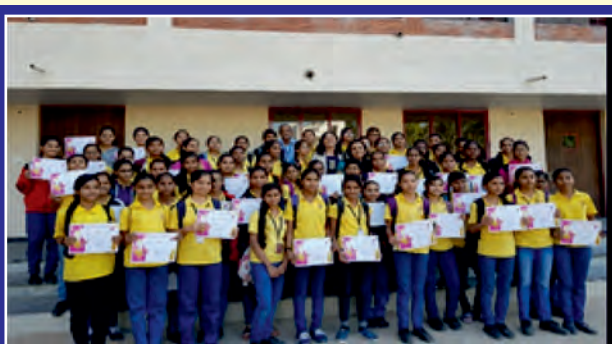
Smart Girl Programme

The first round of selection of students was done from our Scholarship beneficiary students who appeared in an entrance test and scored around 65% or more. Rest of the students were given admission as per their latest school results. The Trust also provided free transport facility to Students from far off areas. Teachers' selection was a meticulous process with active involvement of the Steering Committee members and a good team of teachers were selected with proper qualification, enough experience and compassion for students from this segment of society. A strict norm emphasised to all the teachers was to treat each child with respect and dignity.