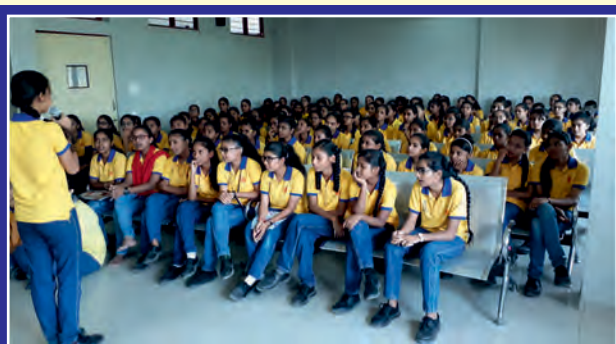
Personality Development Seminar

The entire project is managed in a highly professional way with daily attendance taken and reported to the Steering Committee. Absentees are called daily to understand the reasons and extra efforts are made to ensure discipline, sincerity and positive overall behaviour of students. Throughout the year, there were numerous interactive guest lectures with experts and professionals from varied fields: industries, banks, professors from foreign universities, heads of institutions, businessmen, etc. There were also motivational lectures, Smart Girl initiatives etc. Further, a major field visit was undertaken to Science City, Ahmedabad. Parents-teachers' meets were conducted on a regular basis and counselling on a personal level was done throughout the year.