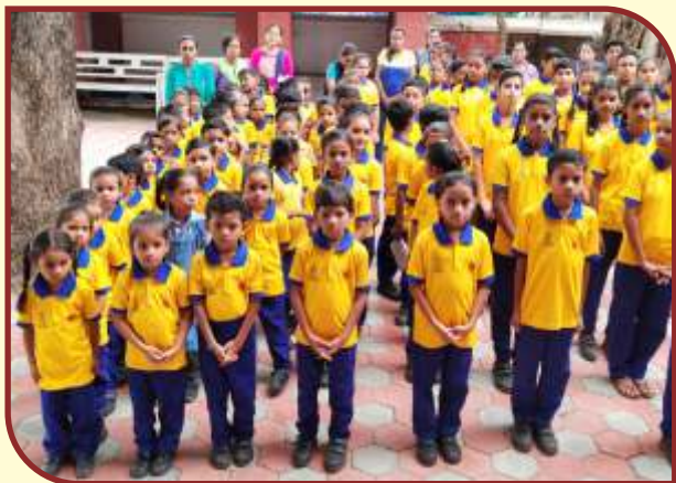
ADMS - ASSEMBLY

Children come and go “hands-free” as all requisite study materials etc are provided at ADMS. ADMS year ended with a prizes distribution event held at MC High School. The conduct and the confidence of young ADMS students had to be seen to be believed. Catching them young is indeed the foundation stone of this initiative.