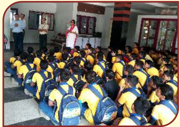
KAYAKALP - GUEST LECTURE