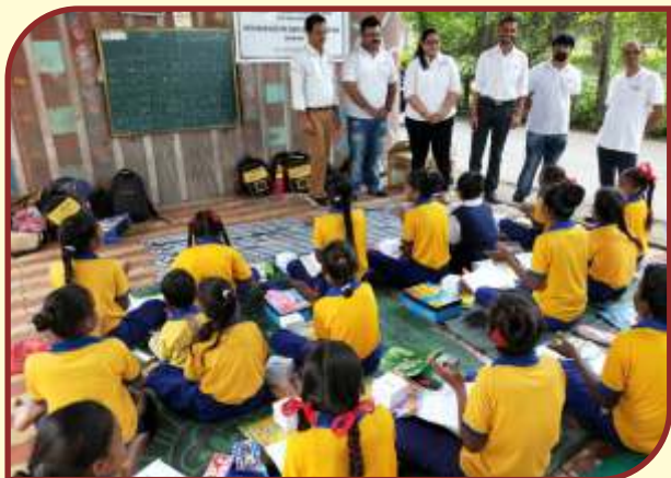
ASHA DEEP - LALBAUG CENTRE

As Asha Deep centres are located in public places, a large number of citizens have become involved over time, offering a variety of support and frequently celebrating birthdays and anniversaries with these children.