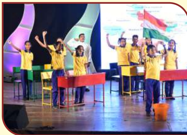
PERFORMANCE BY ADMS STUDENTS