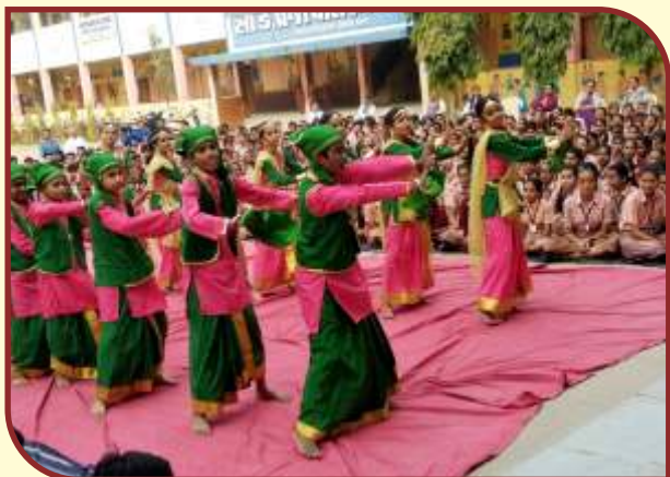
SCHOLARSHIP FUNCTION AT SATYANARAYAN SCHOOL

Additional School-specific support is provided on need basis. Schools also participate in the Annual flagship Cultural Evening and compete with very high quality performances. Over time, a very strong bonding has developed between the adopted schools and MI Family.