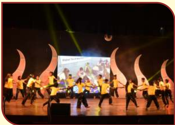
PERFORMANCE BY ASHA DEEP STUDENTS

The program was applauded by everyone present for its outstanding quality, given the very limited time for preparation.