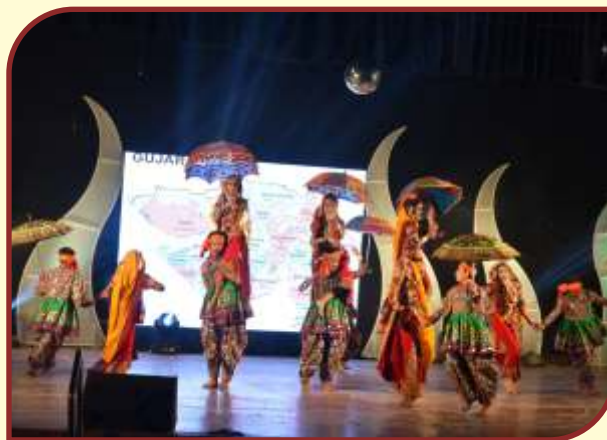
ADOPTED SCHOOL - HUDO DANCE

Cash prizes were given to all the participating students and schools were awarded for different categories, including Overall Winner and two Runner-ups. The overall winner was also honoured with a rotating shield (in addition to attractive cash prizes for all winning schools).