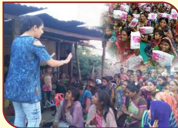
SANITARY PADS - EDUCATION & DISTRIBUTION