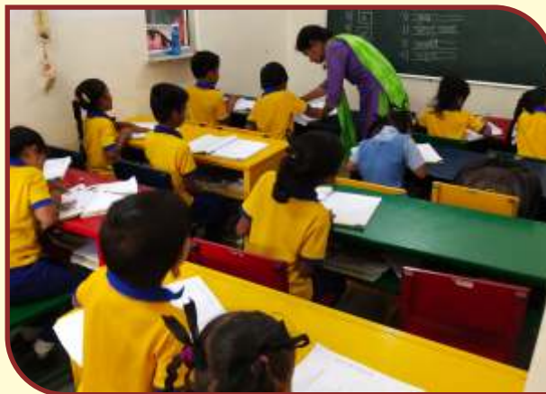
ADMS - CLASS ROOM