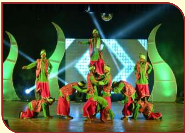
ADOPTED SCHOOL - BHANGRA DANCE

This was followed by non-competitive performances by Kayakalp and Asha Deep students. Competitive dances from seven adopted schools enthralled everyone. The theme included Folk dances from various states from Kashmir to Kanya Kumari. These included Punjabi Bhangara, Rajasthani dance, Adivasi dance from M P, Hudo dance from Gujarat, Bihu dance from Assam etc. Asha Deep Mentor-sponsor children presented a skit and Cube Construction beneficiaries also gave an exciting performance.