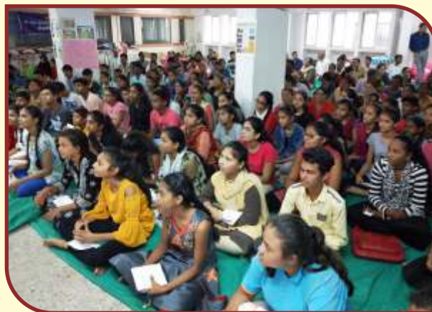
OPEN SCHOLARSHIP FUNCTION AT MANUBHAI TOWER