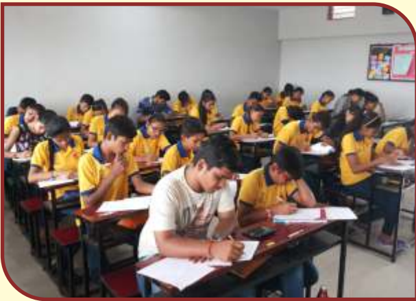
KAYAKALP - CLASS ROOM

As per Kayakalp charter, a lot of emphasis is placed on personality development, communication skills, life skills & spoken English etc. A number of invited lectures from prominent speakers were arranged throughout the year. A two-day Smart Girls' programme was a major highlight which focused on imparting important life skills to Kayakalp girls.