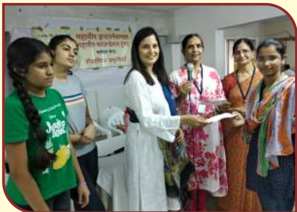
OPEN SCHOLARSHIP - DISBURSMENT

Within a few years of Adopted Schools Initiative, the first major flagship scheme, Open Scholarship Initiative, was launched as more and more students of other schools (and their parents) started approaching MI with request for scholarship assistance. Beginning with fewer than hundred students in 2004, the scheme now caters to close to 4000 students from std. 8th until they finish their first degree. Scholarships are disbursed through 12 to 14 events, each covering close to 250-300 students. On-the-spot re-assessments are done for all old beneficiaries while new applicants are given scholarships based on household visits and personal assessments by esteemed members and volunteers.