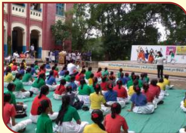
SCHOLARSHIP FUNCTION AT WEBB MEMORIAL SCHOOL