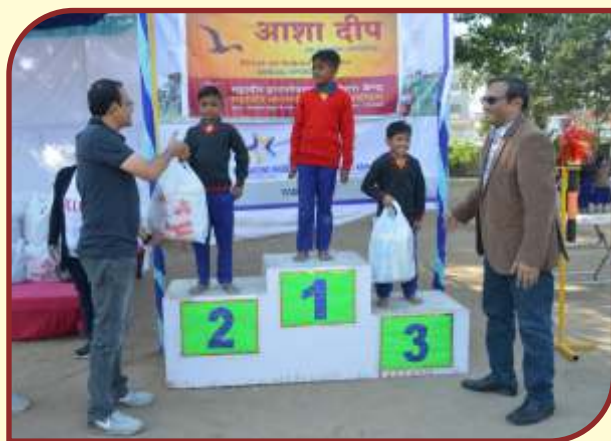
PRIZES BEING AWARDED